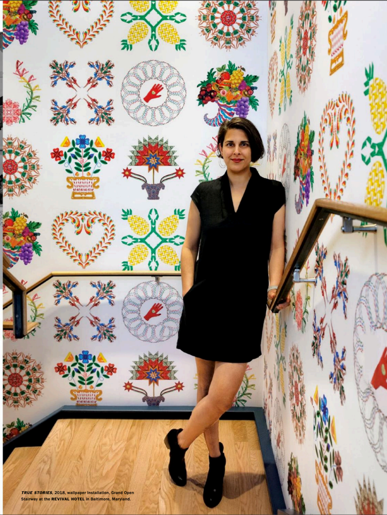
TRUE STORIES , 2018, wallpaper installation, Grand Open Stairway at the REVIVAL HOTEL in Baltimore, Maryland.