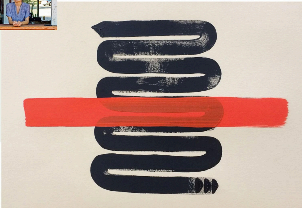
KILL THE BLACK SNAKE , 2017, acrylic on paper, 9 x 16 in.