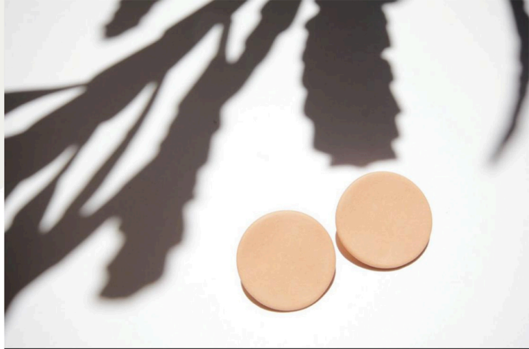
Top to bottom: LARGE DOT EARRINGS , mason-stained porcelain, 1.25 x 1 in.; CASSANDRA BERMUDA BLUE HANDMADE EARRINGS , mason-stained porcelain, 1.25 x 2 in. Opposite: FANNY PENNY wears her own creations.