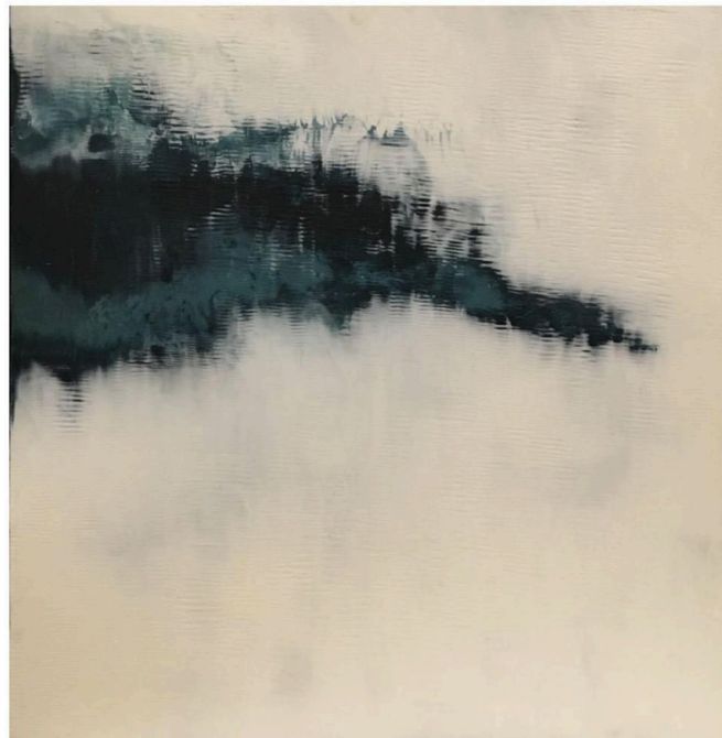
KELLIE BOLTON's KRAKEN , 2018, encaustic on wood panel, 18 x 18 in.